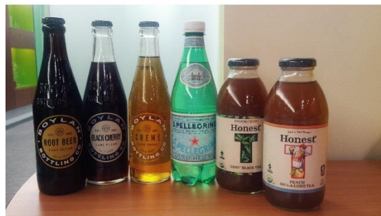
A selection of our specialty beverages

You are welcome to bring your own alcohol at no charge, or we can purchase it for you at cost for the above fee.